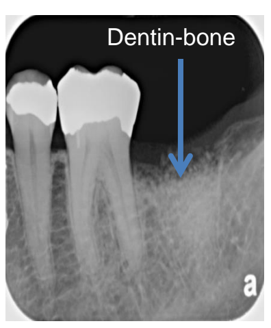
December 2013 – implant placement