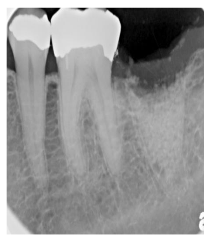
October 2013 – extraction and graft